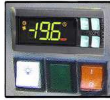
DIGITAL CONTROLLER WITH HIGH HEAD ALARM ON SELF CONTAINED