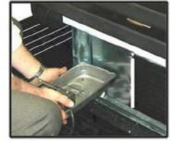
PULL OUT EVAP PAN FOR EASY CLEANING ON SELF CONTAINED