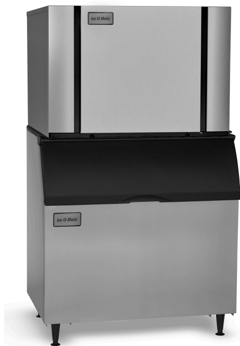
CIM2046 ON B110