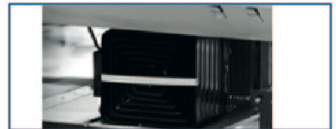
Easy Access to Compressor