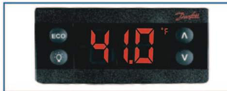
Electronic Digital Controller