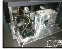
PULL OUT CONDENSING UNIT ON SELF CONTAINED