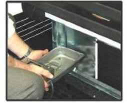
PULL OUT EVAP PAN FOR EASY CLEANING ON SELF CONTAINED