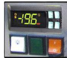
DIGITAL CONTROLLER WITH HIGH HEAD ALARM ON SELF CONTAINED