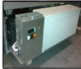
PULL OUT CONDENSING UNIT