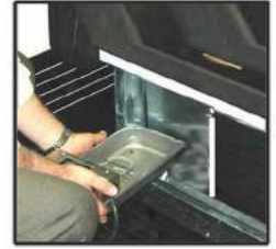
PULL OUT EVAP PAN FOR EASY CLEANING ON SELF CONTAINED