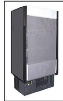
PULL DOWN NIGHT CURTAIN