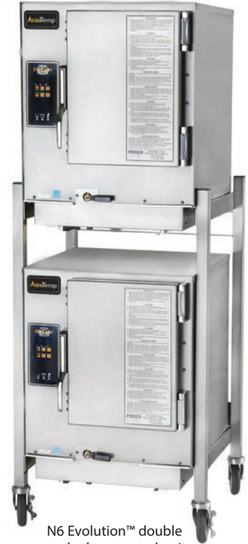
N6 Evolution™ double stacked connected unit mounted on a stainless steel stand with casters

Evolution™ steamer is AccuTemp Products' connected, boilerless steam cooker that utilizes AccuTemp's Patent Pending Steam Vector Technology for faster cook times, improved energy efficiency, better pan to pan uniformity, and less water consumption. Steam Vector Technology requires no moving parts inside the cooking chamber. Steam to be produced inside the cooking cavity with no heating components exposed to water. Unit to be powered by a Heavy Duty Stainless Steel Blue Flame Power burner, Easily connects to water, drain & gas lines. Uses less than 1 gallon of water per hour. Unit to include low water, high water, overtemp warning lights and auto shut off feature. Evolution™ to include heavy duty, field reversible door. Standard digital controls with independent timer. No water quality exclusions to warranty and no water filtration or treatment required. Units to be mounted on a stainless steel support stand. Unit to be UL Safety and Sanitation Certified, and Energy Star qualified. Built in USA.