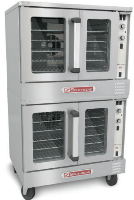
(PCR-2E shown with optional casters)

140°F to 500°F solid state thermostat and 60 minute mechanical cook timer.