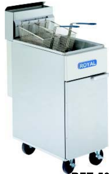
RFT-50 Shown On Optional Casters