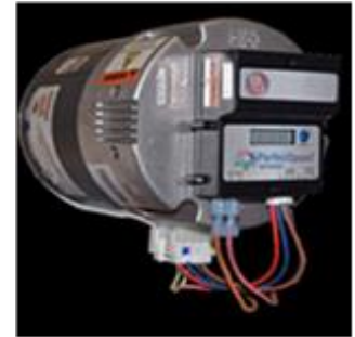
EC (Electrically Commuted Motor) 4.5 Green Points each