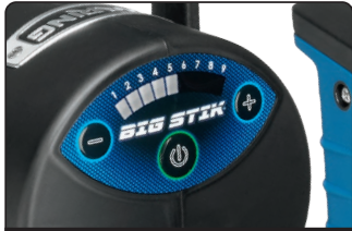
Electronic speed adjustment with LED indicator

12" Heavy-Duty Big Stik® EvolutionX® Immersion Blender