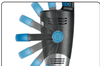
Patented pivoting second handle and comfort grip