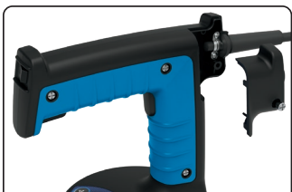
Dual-trigger handle and serviceable cord design