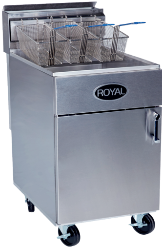
RFT-60 with optional casters