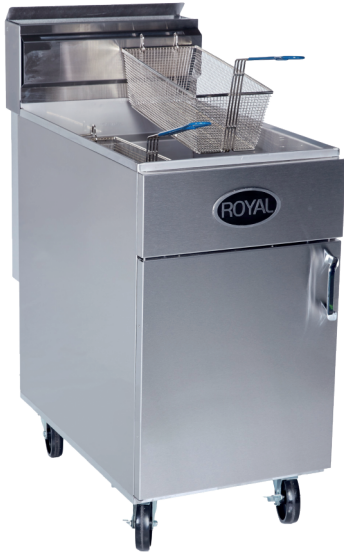
RFT-75 with optional casters