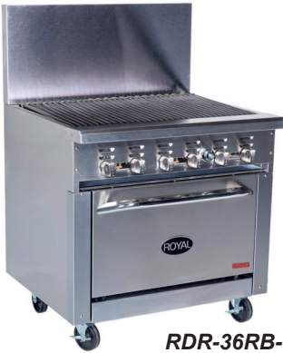
RDR-36RB-126 with optional casters

Models: RDR-24RB-120 RDR-24RB-XB RDR-36RB-126 RDR-36RB-XB RDR-48RB-126