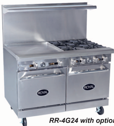
RR-4G24 with optional casters