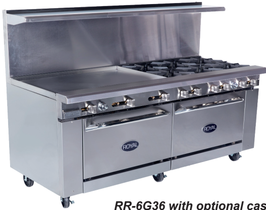
RR-6G36 with optional casters

Models: RR-12 RR-10G12 RR-8G24 RR-6G36 RR-4G48 RR-2G60 RR-G72 RR-10GT12 RR-8GT24 RR-6GT36 RR-4GT48 RR-2GT60 RR-GT72