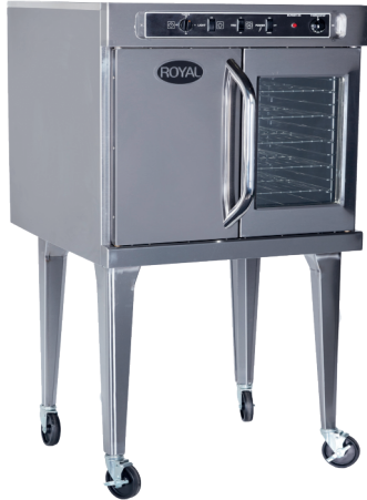
RECO-1 with optional casters

Models: RECO-1 RECO-2 RECO-6K-1 RECO-6K-2