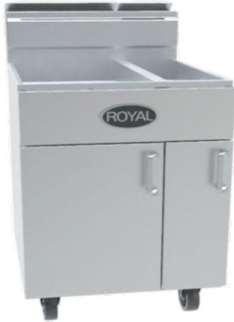
RFT-5025 with optional casters