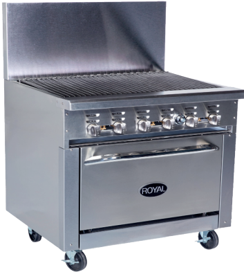
RR-36RB-126 with optional casters