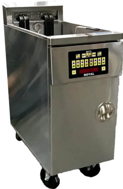
REF-1417-CM shown with optional casters, lift-up elements and crumb screen

Voltage: 208V 240V Phase: 1 Phase 3 Phase