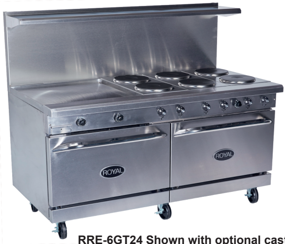
RRE-6GT24 Shown with optional casters