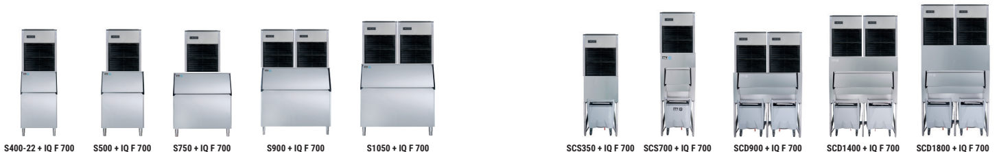
S400-22 + IQ F 700