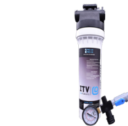
10" FILTER ANTI-LIMESCALE + ANTI-CHLORINE CS-101 K