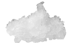
FLAKE ICE 85% ICE HARDNESS FACTOR