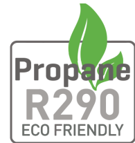
Natural refrigerant R-290 GWP = 0