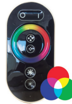
RGB LED lighting [standard]