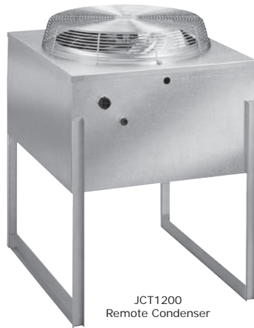
JCT1200 Remote Condenser

*Remote condenser has refrigerant charge for up to 50' (15 m) line length. Over 50' (15 m) requires additional refrigerant charge at time of installation.