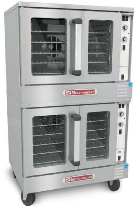
(PCR-2G shown with optional casters)